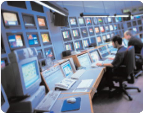
MediaStream is at the center of leading play-to-air facilities worldwide