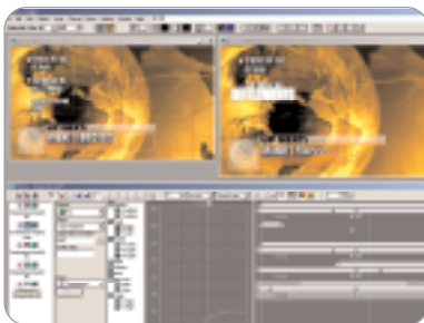
Deko allows for the fast creation of sophisticated animation sequences