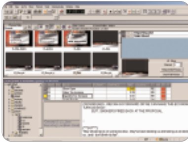
Pinnacle DekoMOS works seamlessly with popular newsroom computer systems