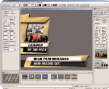
Deko's production-proven user interface is designed for the realities of broadcast television

More broadcasters worldwide rely on Pinnacle Deko than any other real-time graphics system. That's because only Deko delivers a comprehensive graphics solution that combines unmatched creation speed, compelling real-time visuals, advanced automation capabilities, legendary on-air reliability and a suite of tools that simply work better.