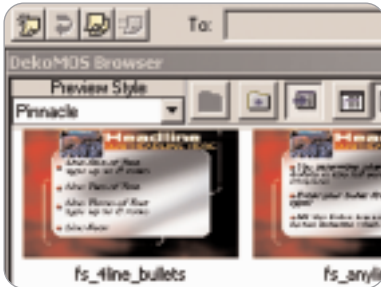
DekoMOS provides graphical browsing of templates