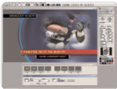
Deko makes working with both SD and HD graphics simple